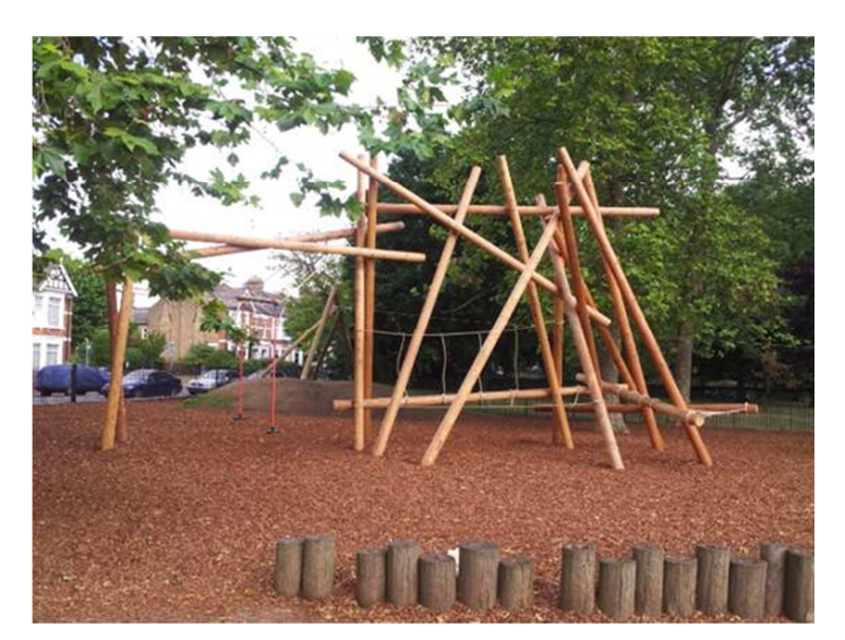
Photograph of Timberwood Tangle